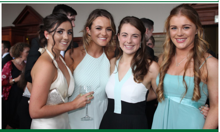
Some of our glamorous debutantes from the class of 2015