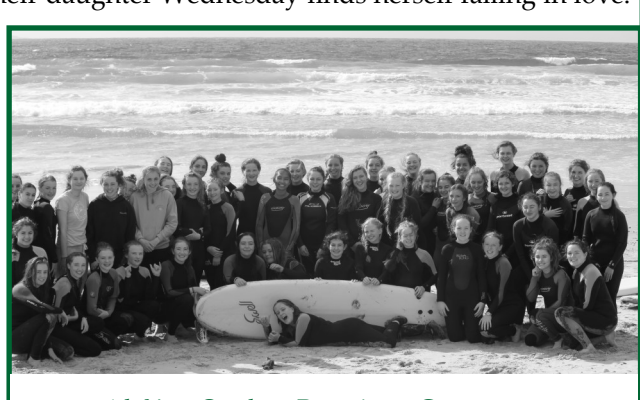
4th Year Outdoor Pursuits to Connemara